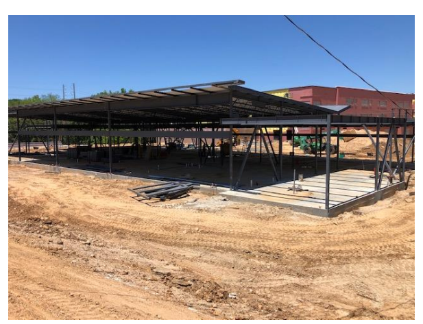
Roof decking at the YMCA