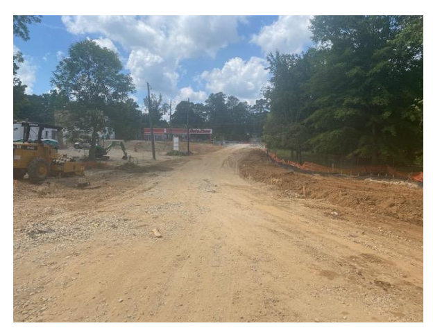
Bus loop ready for curb and gutter