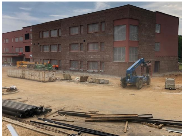
Brick on the NE side of WPA